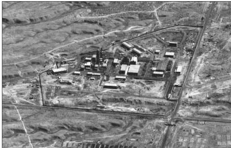
FIGURE 2: AL-SHARQAT CHEMICAL PRODUCTION FACILITY

For example, Iraq has built a large new chemical complex, Project Baiji, in the desert in north west Iraq at al-Sharqat (see figure 2). This site is a former uranium enrichment facility which was damaged during the Gulf War and rendered harmless under supervision of the IAEA. Part of the site has been rebuilt, with work starting in 1992, as a chemical production complex. Despite the site being far away from populated areas it is surrounded by a high wall with watch towers and guarded by armed guards. Intelligence reports indicate that it will produce nitric acid which can be used in explosives, missile fuel and in the purification of uranium.