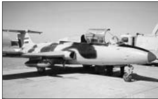
FIGURE 3: THE L-29 JET TRAINER