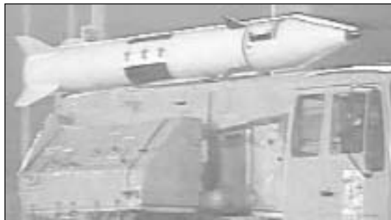
FIGURE 4: ABABIL-100

been produced. Intelligence also indicates that Iraq has worked on extending its range to at least 200km in breach of UN Security Resolution 687. Production of the solid propellant Ababil-100 (Figure 4) is also underway, probably as an unguided rocket at this stage. There are also plans to extend its range to at least 200km. Compared to liquid propellant missiles, those powered by solid