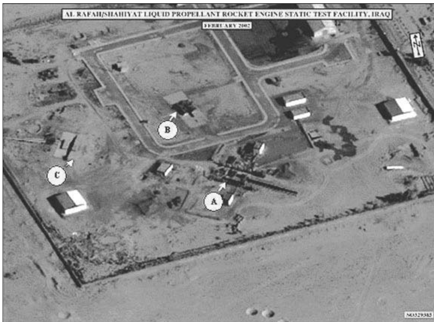
FIGURE 6: AL-RAFAH/SHAHIYAT LIQUID PROPELLANT ENGINE STATIC TEST STAND