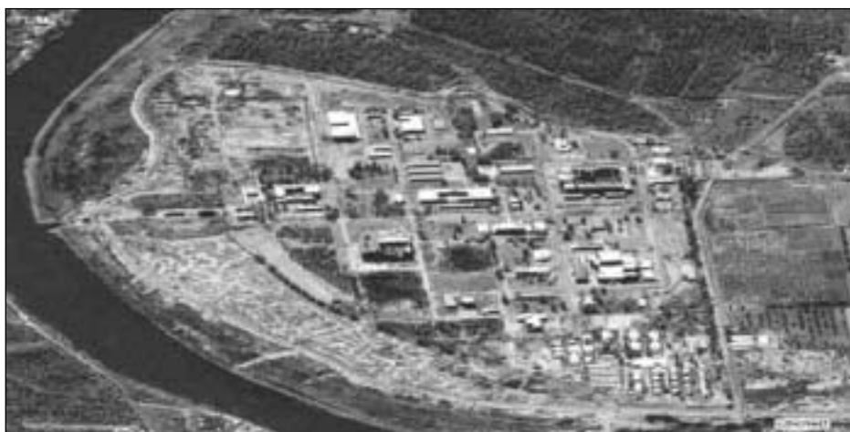
FIGURE 1: THE IBN SINA COMPANY AT TARMİYAH