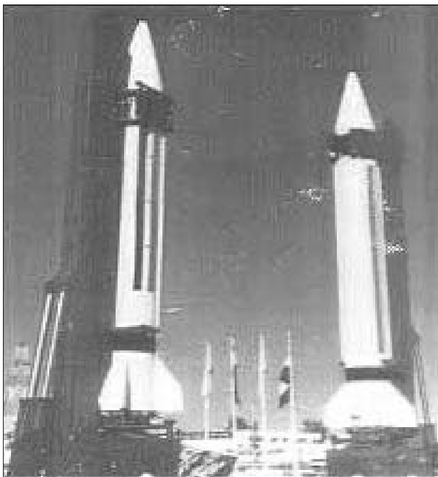
FIGURE 5: AL-HUSSEIN